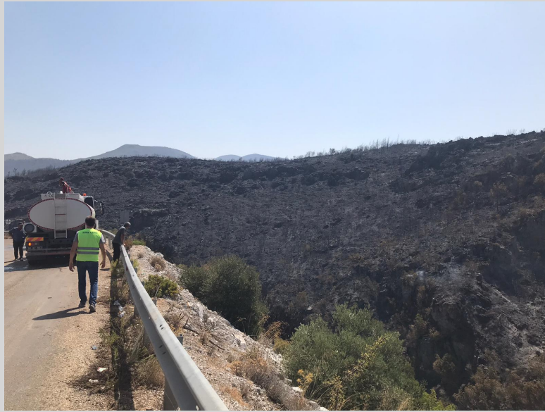
Burnt woodland in Milas, Bodrum 04.08.2021