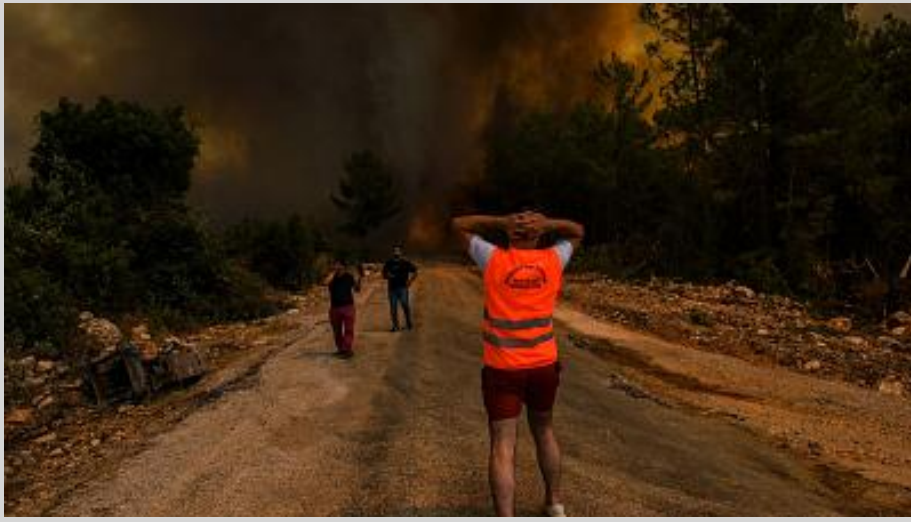
People watch the fire raging over Antalya, Turkey 01.08.2021