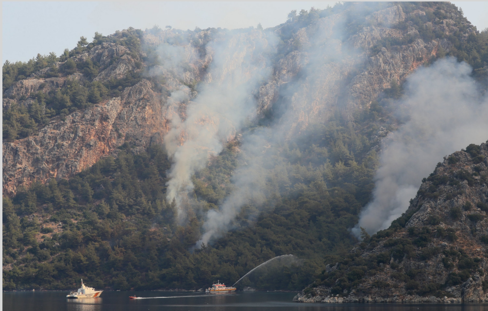
Smoke billowing over a forest near the coast of Marmaris, Muğla 04.08.2021